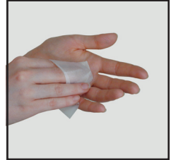
Wipe hands or skin for 30 seconds using one side of wipe.