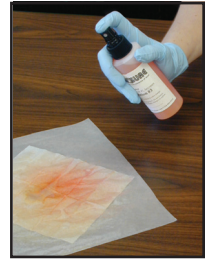
Aim at soiled wipe and depress nozzle 2 times.