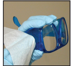
Wipe safety glasses, phones, shoes, etc. thoroughly using one side of wipe.

When taking surface samples that are to be sent to a laboratory for analysis (Lab Analysis Kit) use a template to specify the sample area.