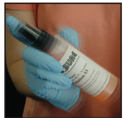
Shake well to mix.