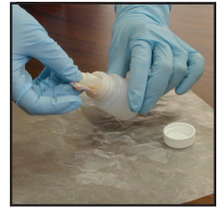
Insert in sample collection bottle and label.