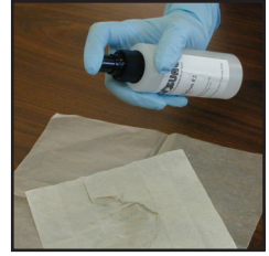
Aim at soiled wipe and depress nozzle 3 times.