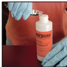
Pour one vial of Disclosing Powder #1 into Developing Solution #3 spray bottle.